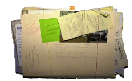
You wouldn't take this into court would you?

People shouldn't judge a book by its cover but they do. It's just a fact of life. For example, your personal appearance should be as professional as possible, especially when you're in front of the client, court, or opposition. Your Trial Notebook should maintain a professional appearance as well in order to command respect from the jury, confidence from your client, and to intimidate the opposition.