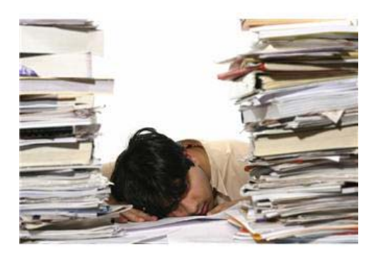
Could you navigate your way through a ton of important documents without a good, logically organized Trial Notebook?

Sadly, in such a short ebook we can only speak in generalities with your Trial Notebook. There are so many types of cases. You might be working either side of civil or criminal, tax or tort, paternity or product liability, contract or malpractice, family or corporate. However, trials do have some foundational elements to them, so we'll give you the framework you'll need that will help you prepare the best Trial Notebook you possibly can. Let's look next at " Basic Structure. "