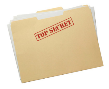
Use cover sheets and exercise caution in court to keep prying eyes off your documents!