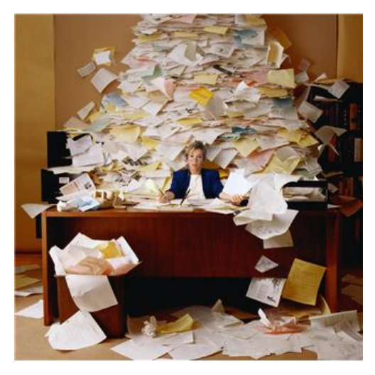
A little organization can sometimes help tame the bigger problems!

Keep in mind that even though we're listing sections in this order and about to provide you with some forms to put in those sections, that this is more an offer of constructive suggestions than any sort of insistence that you do things our way. This is all here as a place to start for the new folks and a fresh perspective for those of you who've done this for a while.