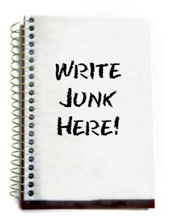
Though this is a hardcopy notebook, it doesn't help. Work from templates, forms, and checklists.