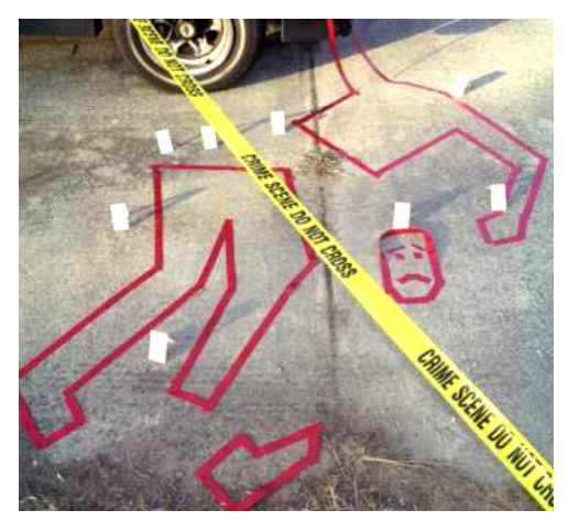
Structure is good! It's hard to be happy unless all the parts are together.

But that's not all! There are still so many tips to give you that the next section following "Useful Content" is called "Putting it All Together" where we've provided even more points on assembling both your physical and electronic Trial Notebooks and for getting ready to present your case in court.